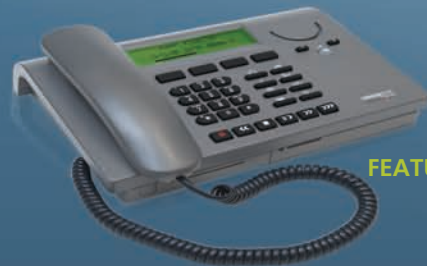
FEATURE PHONE 175