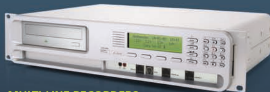
MULTI-LINE RECORDERS OCTO - ISDN II - PRI

The Call Recorder PRI excels (like the previously mentioned units) in the ease of connecting and the straightforward setup. Up to thirty channels can be recorded simultaneously while the power consumption is less than 15 Watts